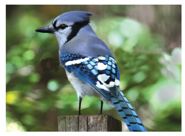
Blue Jay.

There are many historical accounts of Blue Jays in the Central Carolinas. Like our other Corvids, the Blue Jay was a known egg thief, and despite its good looks, it developed an unpleasant reputation. In fact, the Blue Jay was once known as the "Devil Bird" here. It was believed to be a spy, messenger, and aid to Satan. According to North Carolina's adopted science text for grade schools in the early 1900s: "Almost every Southern child has been told the story of the Jaybird's visits every Friday