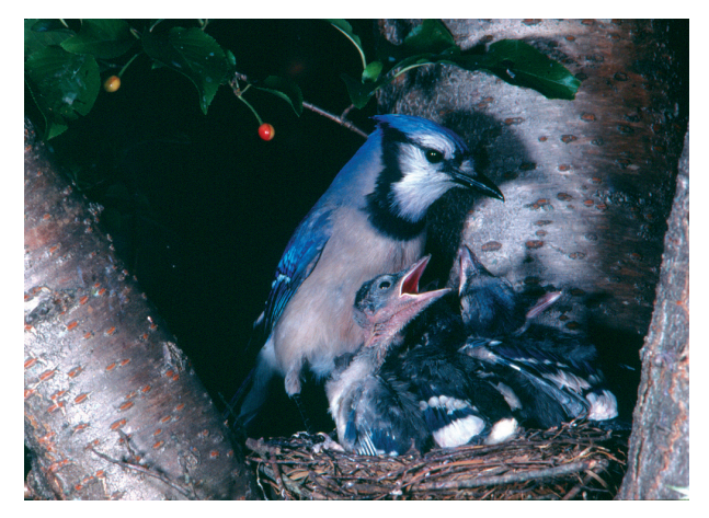
Blue Jay at nest feeding nestlings.