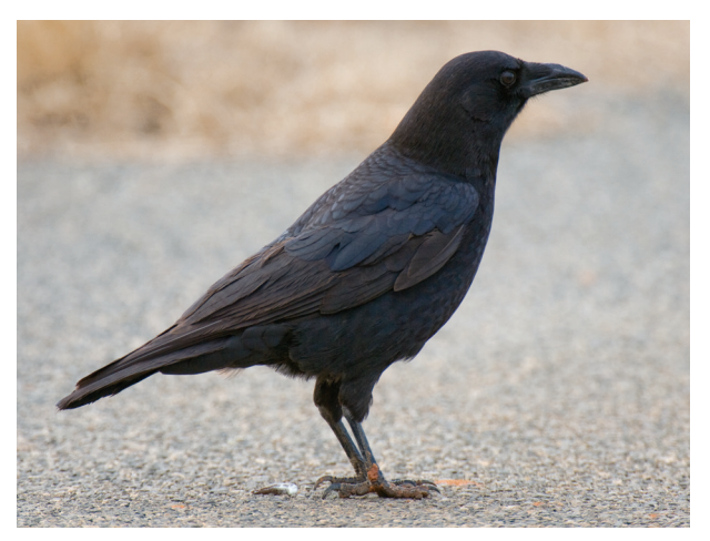
American Crow.

A thief, scoundrel pirate, marauder, scavenger, raucous-voiced despoiler of duck nests—these are but a few of the printable adjectives ascribed to the crow. He is a clown, a mimic, a tormentor, and a tender, loving parent. In addition to this and more, he is one of the smartest birds, ranking high in intelligence and physical development. One of the most universally hated and persecuted of birds, the crow has followed mankind throughout the limits of agriculture, and has held his own in number despite massed gunfire, bombing, and poison. One cannot help admiring such a bird even though it