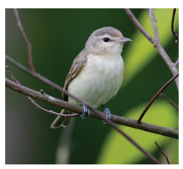
Warbling Vireo.

This bird is primarily known as a rare spring migrant in the Carolina Piedmont and there are only a handful of fall reports. Spring migrants have been reported in this region as early as 22 April, and they have generally moved through by the second or third week of May. Fall migrants have been recorded as early as 2 August and as late as 11 October. Three birds is our highest one-day count.