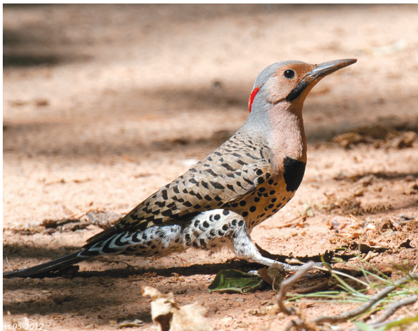
Male Northern Flicker foraging on the ground.

Although Northern Flicker remains common, its declining abundance, evident since 1966, is alarming. No rigorous, focused studies identify the cause of this decline; 3 hypotheses: (1) competition from European Starlings for nest