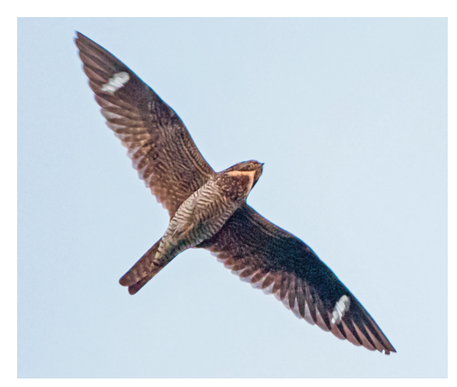
Common Nighthawks are easily identified by the white marks on the undersides of their wings when in flight, as shown in this Cabarrus County bird. (Phil Fowler)

In the late 1800s, there was a growing awareness of the importance of bullbats and other insect-eating birds to our agricultural economy, and there was a growing movement to stop the widespread killing of these and many other species of birds. Many citizens cried out for laws to protect the birds, and soon these requests were answered.