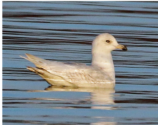
Iceland Gull on Lake Norman. (Jim Guyton)