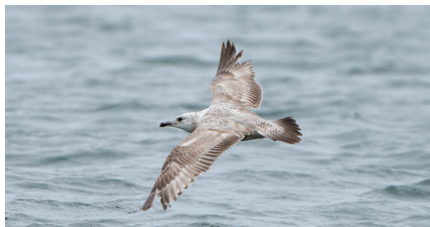
Herring Gull.