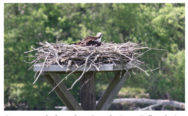
Osprey nest platform along Catawba River.