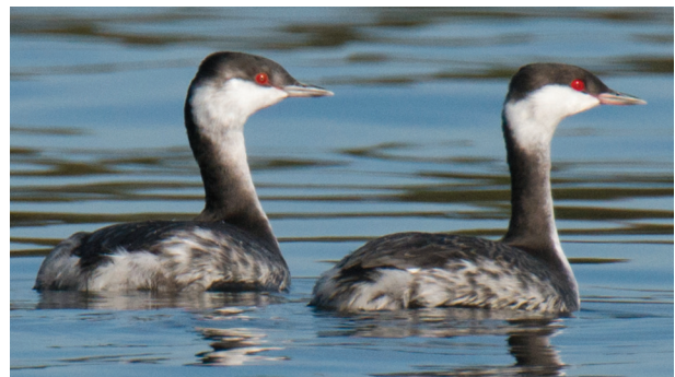
Horned Grebes on Lake Norman in early November.