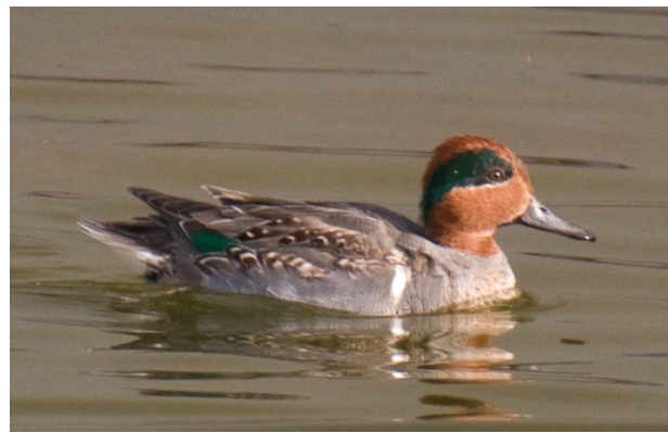
Male Green-winged Teal. (Jeff Lemons)

South Carolina duck harvest data summarized from the last 12 years ranks the Green-winged Teal as the third most harvested duck in the Broad River region, just behind Ring-necked Duck and the Mallard.